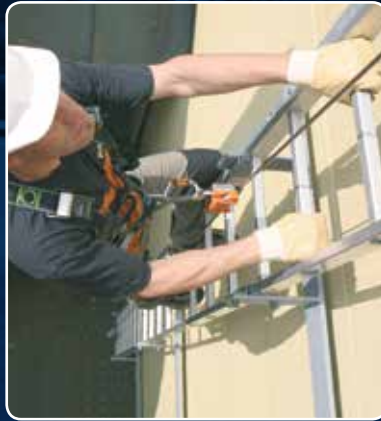
Vi-Go™ Ladder Climbing System