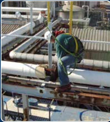
Xenon® Permanent Horizontal Lifeline System