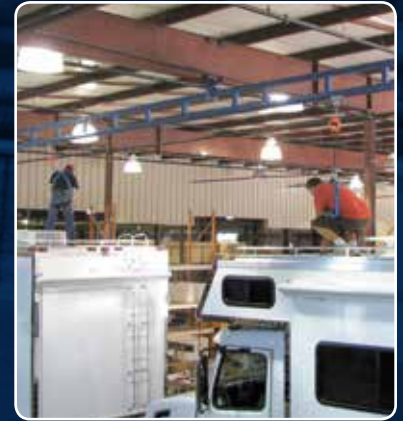
Track Type Rigid Rail System